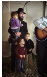
Rabbi and children enjoy the music