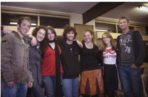
Some of the NEJC youth